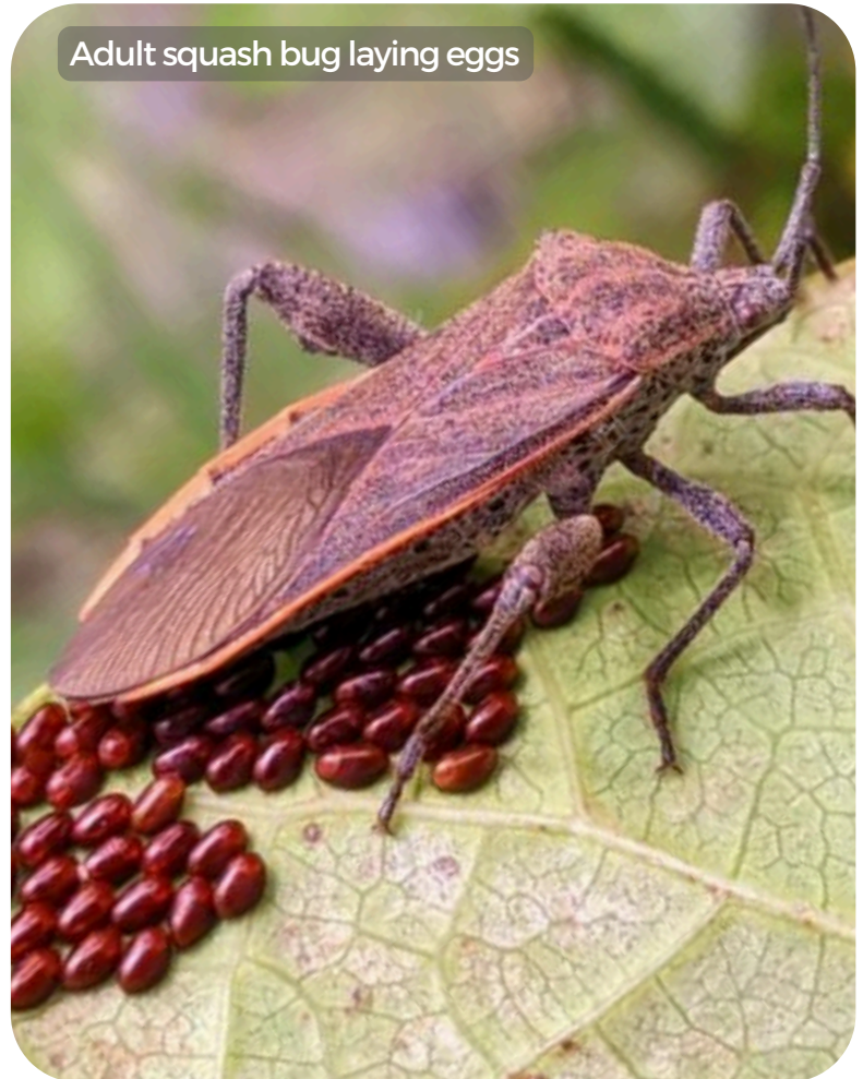
Adult squash bug laying eggs

In the winter, I seek shelter and hide until spring. As temperatures warm, I fly to a squash plant and lay my eggs.