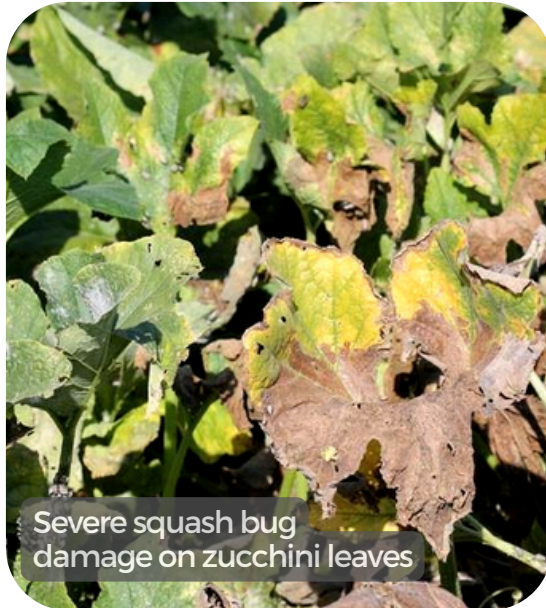
Severe squash bug damage on zucchini leaves