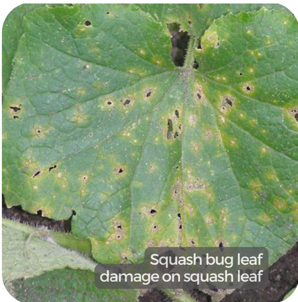
Squash bug leaf damage on squash leaf