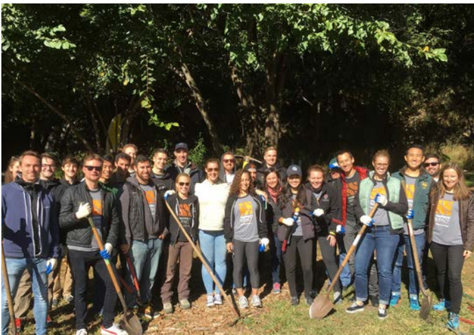
App Nexus volunteers helped to plant a portion of 2,000 trees, including 300 disease-resistant Chestnut Trees, as part of a reforestation project NYRP began in 2015.