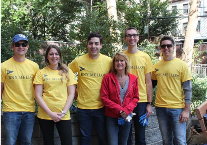
BNY Mellon volunteers helped build four raised garden beds and installed benches at Los Sures, a social service organization in Williamsburg, Brooklyn.