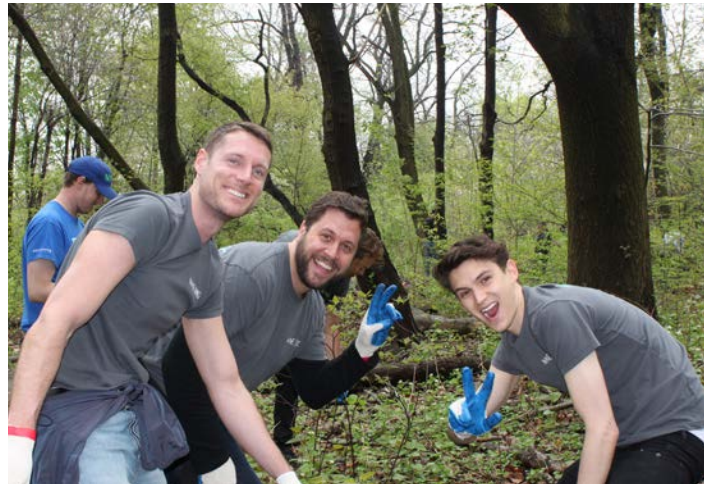
William Morris Endeavor volunteers removed invasive vegetation and helped to prepare Highbridge Park for the spring season.