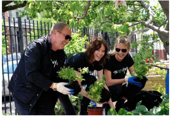
Michael Kors, Freja Beha Erichson, and Martha Hunt have a laugh at Essex Community Garden in Brooklyn