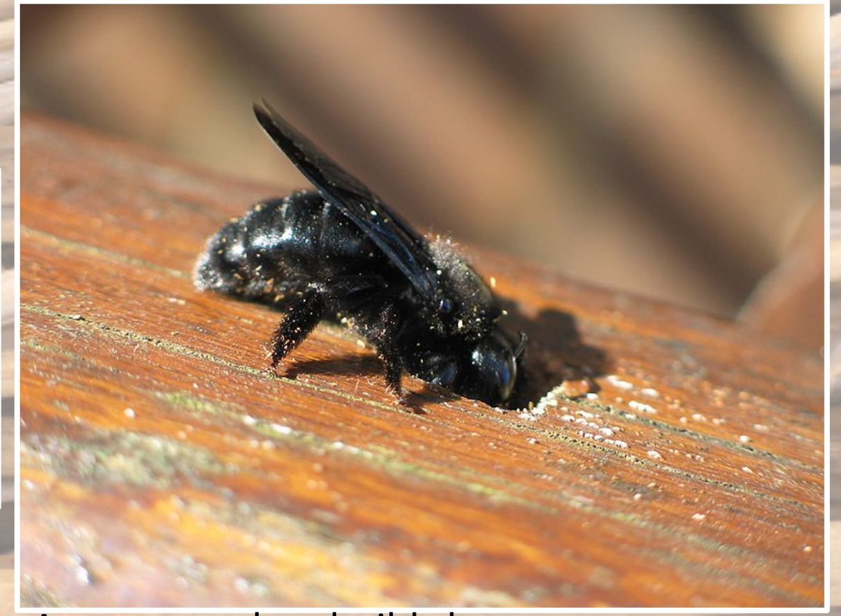
A carpenter bee builds her nest.